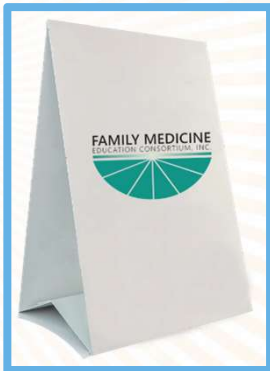
Table Tents/Plenary Chair Drop

Want to stand out and have your brand in front of attendees? Choose this exclusive (1 per plenary) offer. FMEC staff will place your materials on chairs or tables prior to the plenary sessions to be there to greet attendees.