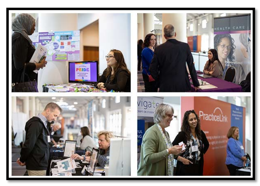
The 33 exhibitors at the FMEC Annual Meeting provided important information about new products and services, educational tools, job openings, and more. Thank you to the FMEC's 2023 exhibitors!